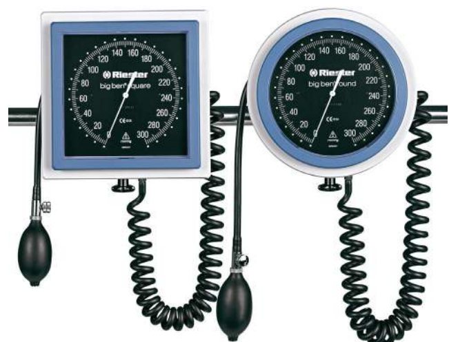
big ben® rail model

Chromium-plated tube screw connection to allow quick changing of cuffs.